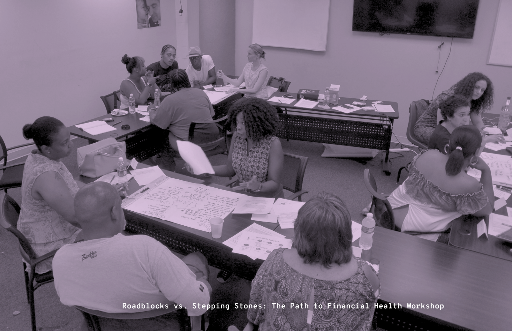
Roadblocks vs. Stepping Stones: The Path to Financial Health Workshop