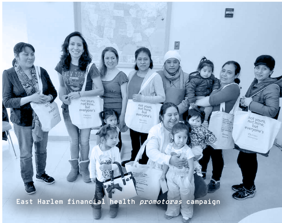
East Harlem financial health promotoras campaign

In East Harlem, New Economy Project partnered with the Lower East Side People's Federal Credit Union (LESPFCU) to implement a three-month intervention aimed at increasing community members' use of banks/credit and awareness of banking rights and options. The intervention used "pop-up" credit union branches as extensions of the already existing LESPFCU's East Harlem branch as well as a "promotoras" peer-education campaign. The East Harlem team designed the intervention in close consultation with Spanish-speaking immigrant community members who face particular barriers to achieving financial health and to accessing basic financial services, barriers OFE describes in our Immigrant Financial Services Study .